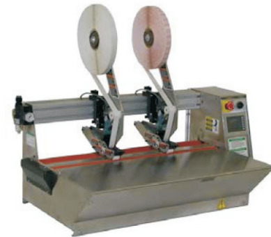
T-646WI Application System Product Up To 30" Wide Shipping weight 300 lbs.