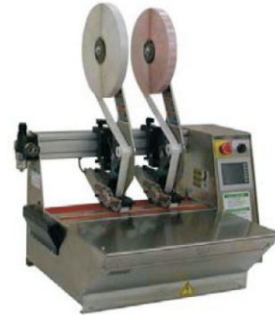
T-646I Application System Product Up To 18" wide Shipping weight 275 lbs.